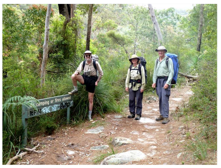
On the Jerusalem Bay Track.

After again packing away the boats, we walked up the final 2.5 kms beside an attractive flowing creek to Cowan Railway Station and waited for the next train, which well within the hour took us swiftly to our respective destinations of Eastwood and Strathfield. All agreed that this was a very enjoyable and unusual trip, displaying the versatility of walking and packrafting. We commend this activity to the Club.