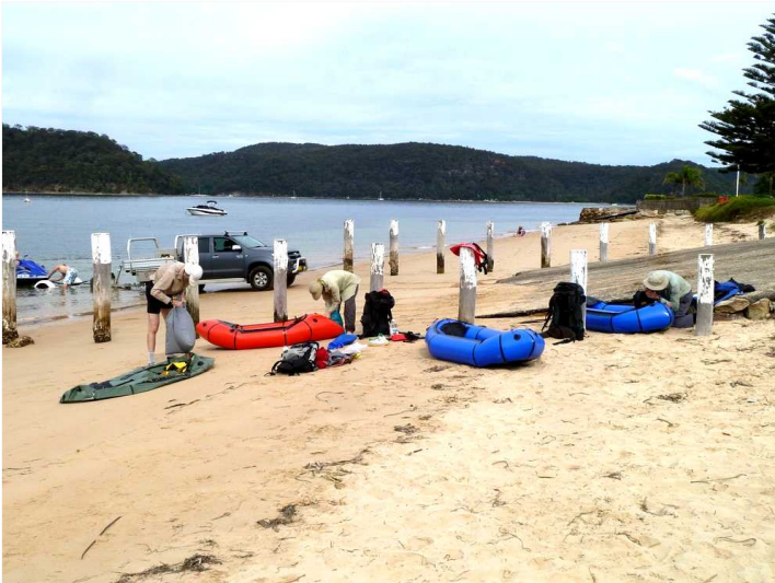
First launch at Sand Point at Palm Beach.