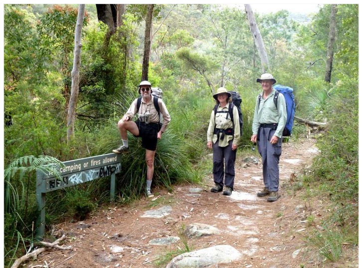
On the Jerusalem Bay Track.

After again packing away the boats, we walked up the final 2.5 kms beside an attractive flowing creek to Cowan Railway Station and waited for the next train, which well within the hour took us swiftly to our respective destinations of Eastwood and Strathfield. All agreed that this was a very enjoyable and unusual trip, displaying the versatility of walking and packrafting. We commend this activity to the Club.